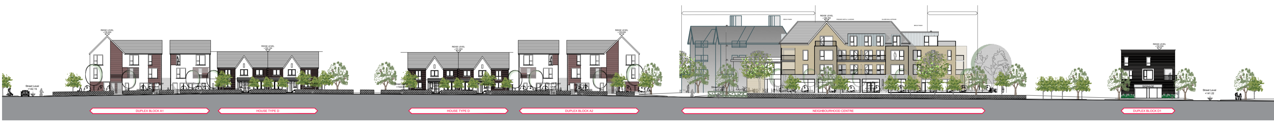
SITE SECTION JJ Scale 1:500