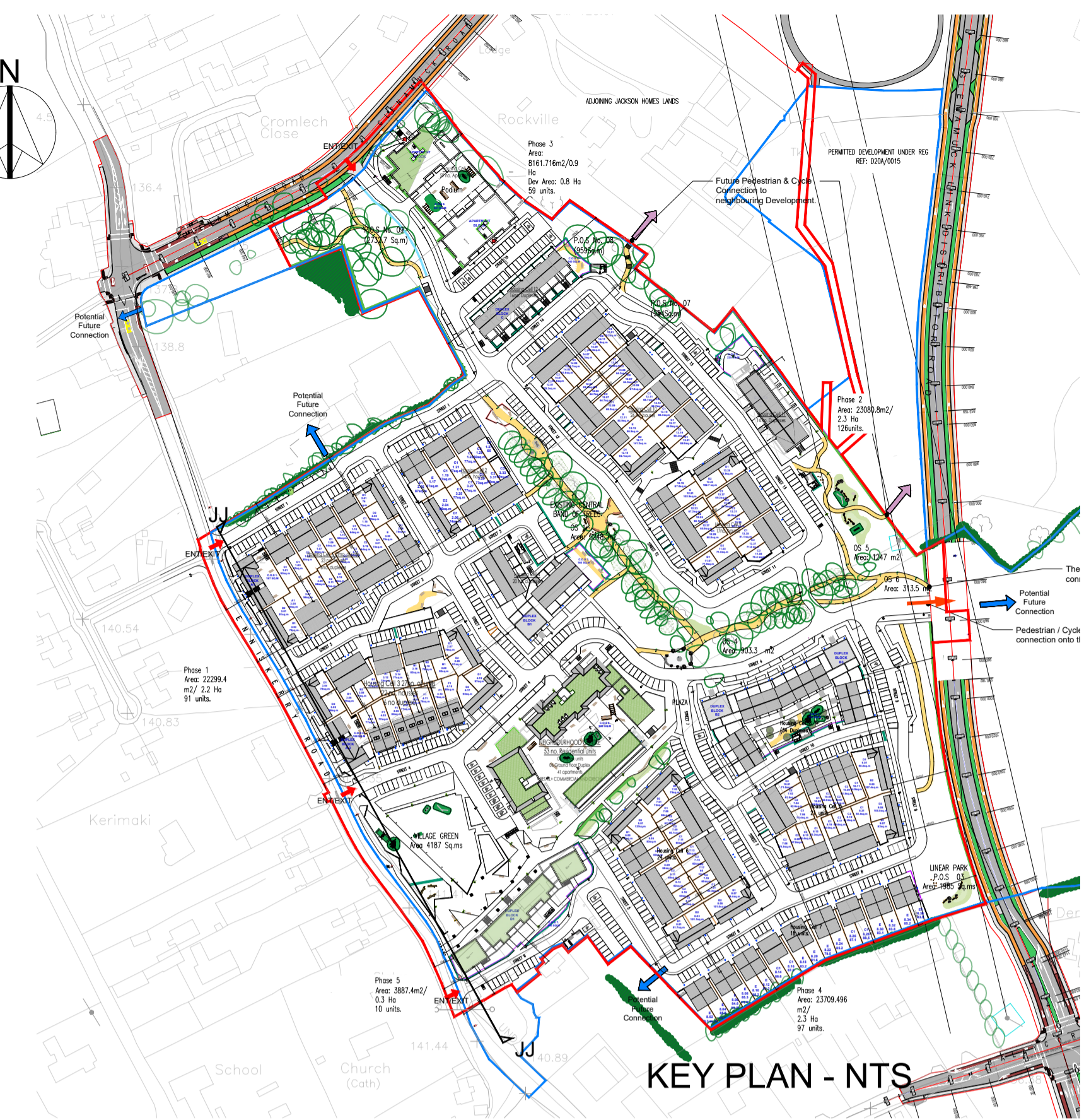
KEY PLAN - NTS