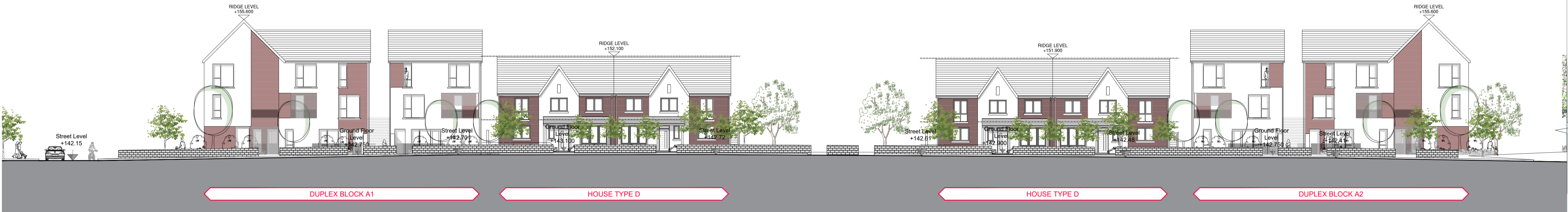
SITE SECTION JJ - Left Side Scale 1:200